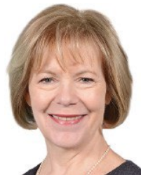
Sen. Tina Smith (D – MN) Authorizer Member: Indian Affairs and HELP