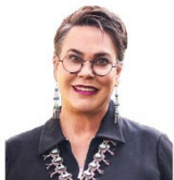
Rep. Harriet Hageman Wyo.