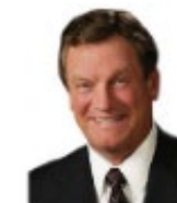
Rep. Mike Simpson Idaho