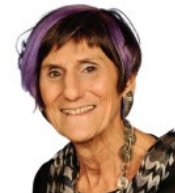
Rosa Delauro CT-03