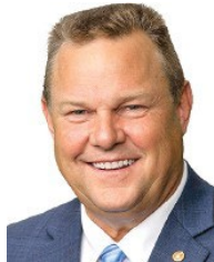
Sen. Jon Tester (D – MT) Appropriator and authorizer Member: Indian Affairs, Interior Appropriations