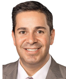
Sen. Ben Ray Luján (D – NM) Authorizer Member: Indian Affairs, HELP Committee