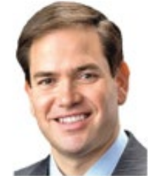
Sen. Marco Rubio (R – FL) Appropriator Member: Interior Appropriations, Labor/HHS Appropriations