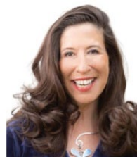
Rep. Teresa Leger Fernandez, N.M.