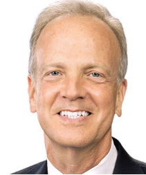
Sen. Jerry Moran (R – KS) Appropriator and authorizer Member: Indian Affairs, HELP, Labor/HHS Appropriations