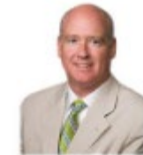
Rep. Robert Aderholt Ala.