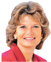
Sen. Lisa Murkowski (R – AK) Appropriator and authorizer Ranking Member: Interior Appropriations Vice-Chair: Indian Affairs Member: HELP