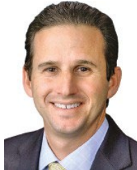
Sen. Brian Schatz (D – HI) Appropriator and authorizer Chair: Indian Affairs Member: Labor/HHS Appropriations