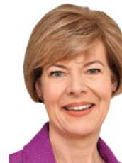
Sen. Tammy Baldwin (D – WI) Appropriator and authorizer Chair: Labor/HHS Appropriations Member: HELP