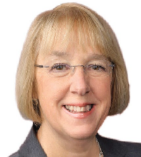
Sen. Patty Murray (D – WA) Appropriator and authorizer Chair: Appropriations Member: Labor/HHS Appropriations, HELP Member: Democrat leadership