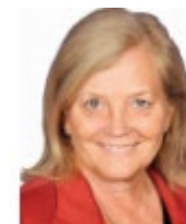
Chellie Pingree ME-01